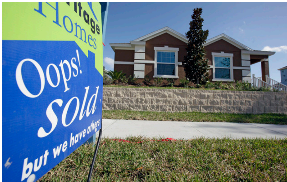
Although sales are up, prices aren't. Median home prices in Salt Lake County in January fell to $171,000 from a near-peak of $220,000 in the same month in 2007.